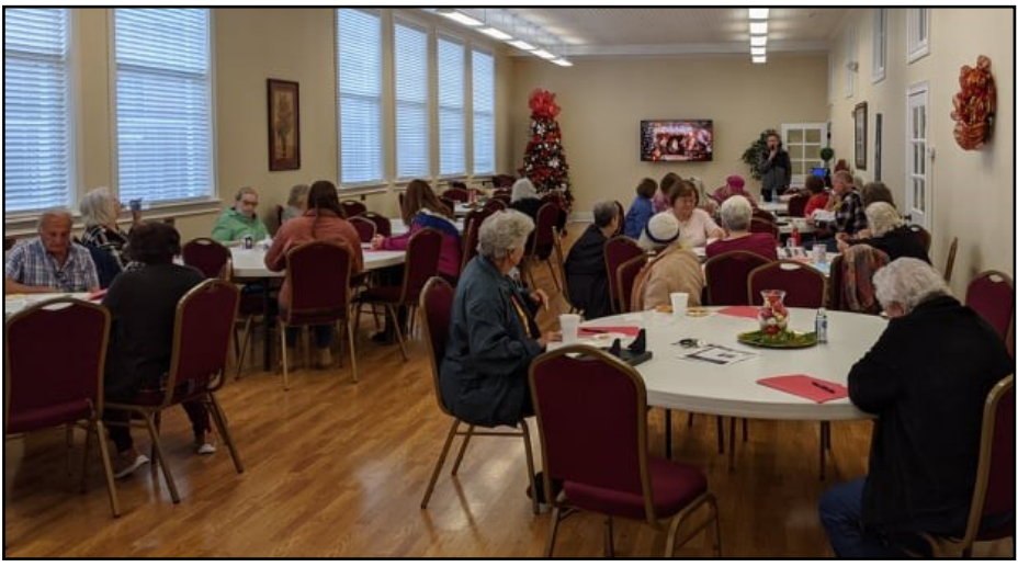
Attendees of the SGRC-AAA Public Hearing at the Bacon County

Access to Information on Aging Services, Safety, Security, and Protection, and Transportation were the top three key issues named.