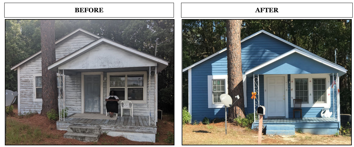
Continued on the next page

The residents of six houses in the City of Douglas have benefitted from the rehabilitation of their homes through the City's recently completed 2017 Community HOME Investment Program (CHIP). The City of Douglas was awarded $306,000 in CHIP grant funds to provide safe and decent housing through the rehabilitation of six owner-occupied homes. Despite the increase in construction materials due to the COVID-19 pandemic, the City was able to successfully complete all six houses because the local government decided to utilize set-aside funding to ensure the final house was finished. Before and after pictures are included with this article. Although the 2017 CHIP has been completed, the City was awarded $400,000 in 2021 CHIP funding and is continuing its endeavor to address substandard housing.