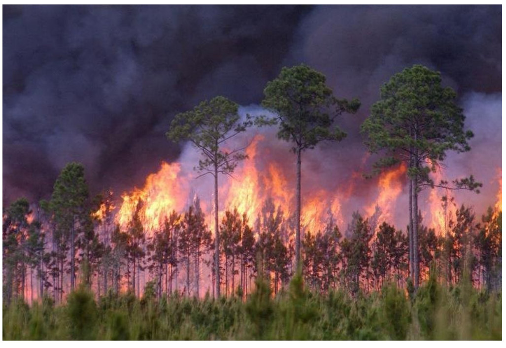
Wildfire roars through the treetops of pines in Ware County , 2007

cause of the potential in Georgia to experience a wide range of natural disasters, the Georgia Emergency Management and Homeland Security Agency (GEMA/HS) promotes the concept of hazard mitigation planning. Each county in Georgia is required by the GEMA and the Federal government to maintain a current Hazard Mitigation Plan, which has a five-year lifespan. In the Southern Georgia Regional Commission (SGRC) region, Planning