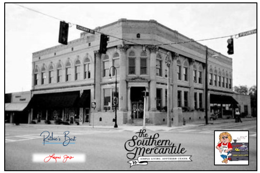
Fourth & Cherry Foods in Ocilla

a subsidiary of The Fourth & Cherry Company and is located in the same building. Fourth & Cherry Foods produces "small batch finished food products" for wholesale and retail sales. Small batch foods are packaged food products such as jams, jellies, preserves, BBQ sauces, salsas, etc. Fourth & Cherry Foods has some owned brands, but also provide co-packing services for start-up food companies to facilismall batch production tate needs. Fourth & Cherry Foods began manufacturing in the sum-